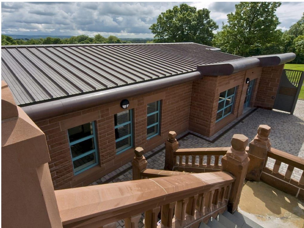
Figure 6.2 – Copper standing seam roof system

Figure 6.2 shows a standing seam roof system produced from copper coil.