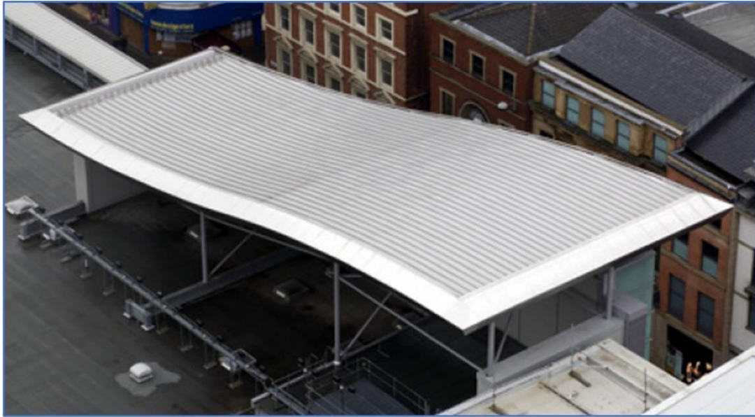
Figure 6.1 shows a standing seam roof system produced from stainless steel coil