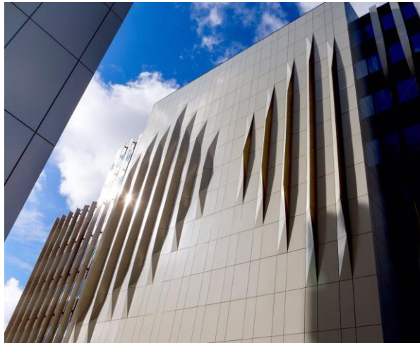
Typical rainscreen façade system

The assembly must include site installed fire stops and cavity barriers at pre-determined vertical and horizontal intervals and at the surrounding positions of through wall penetrations to stop the progression of fire