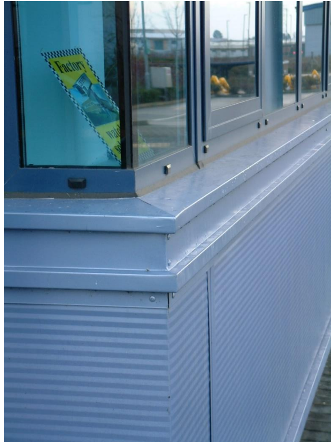
Fig 3 Showing consistent colour match between the panel and the flashing

It should be noted that if a building is being extended, the new extension may show a slight colour variation from the original as it will be from a different manufacturing batch and production run and the original cladding will have weathered.