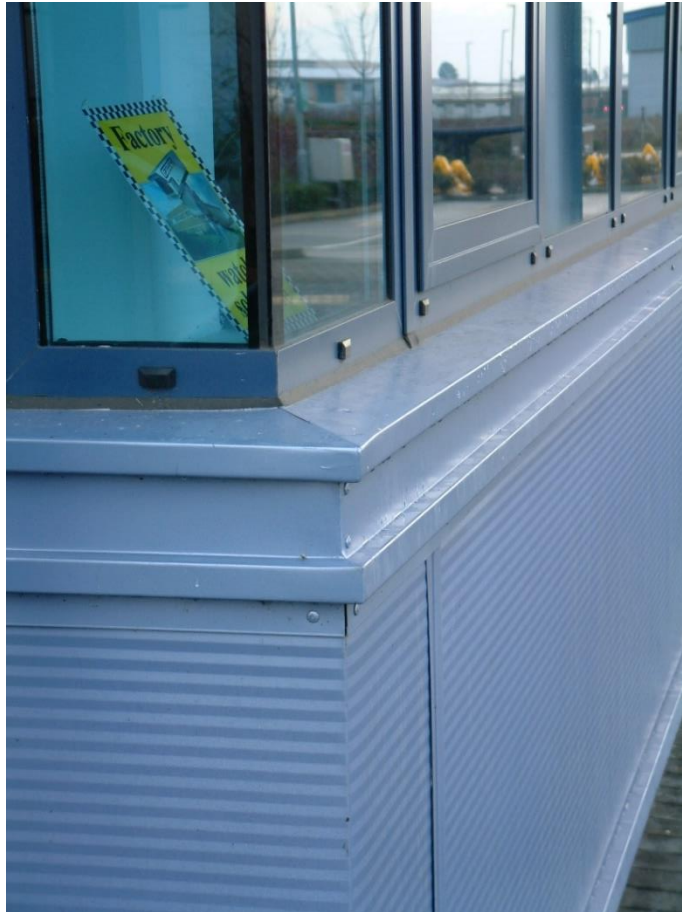
Fig 3 Showing consistent colour match between the panel and the flashing

It should be noted that if a building is being extended, the new extension may show a slight colour variation from the original as it will be from a different manufacturing batch and production run and the original cladding will have weathered.