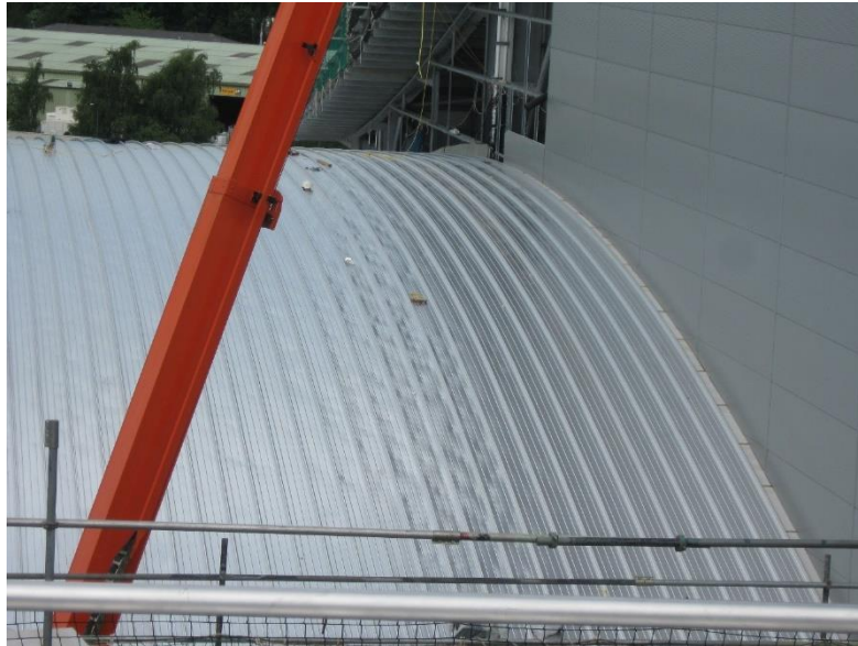
Fig 5 An example of oil canning due to radius of standing seam aluminium.

Visible rippling, oil canning and distortion on profiled wall sheets is typically caused by excess stress being applied at the installation stage resulting in a deformation of the profile. It is commonly caused by a misalignment of the underlying steelwork adding uneven pressure to the profile. Steel work alignment tolerances should be included in the NBS H31 spec at design stage.