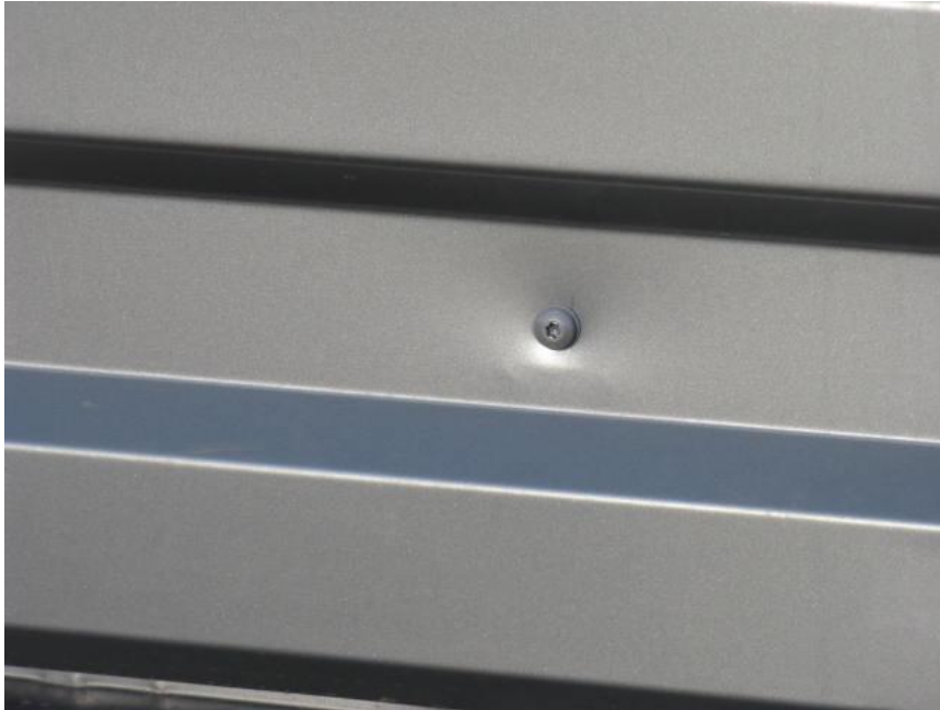
Fig 8 Example of an over tightened fastener

On walls the greater consideration is aesthetics. However, some current tested and certified firewall twin skin systems include a quilt insulation layer (or additional layer) compressed OVER the spacer rail.