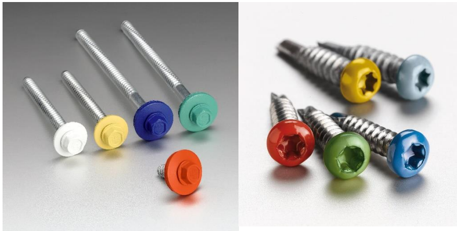
Fig 4 Examples of different colour head and fasteners

Coloured matched fastener heads can sometimes appear slightly different in colour to the metal sheet, due to their surface profile being at a different angle to the metal, and being made from different materials such as nylon, or painted/coated in a separate process from the metal sheet. Also, degradation of the pigments in the fastener head colouring may differ from that in the cladding surface over a period of time.