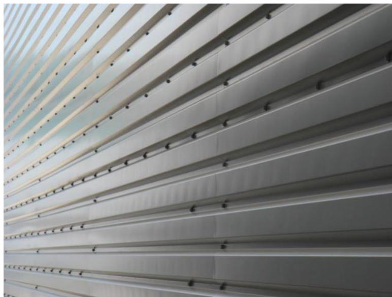
Fig 6 Oil canning on a trapezoidal profile.

The alignment of the support structure should be checked prior to installation of the profiles and any discrepancies rectified before installation. Reference should be made to MCRMA guidance documents GD 24 Installation of purlins and side rails and GD 27 Installed tolerances: best practice design guide for more information on this topic.