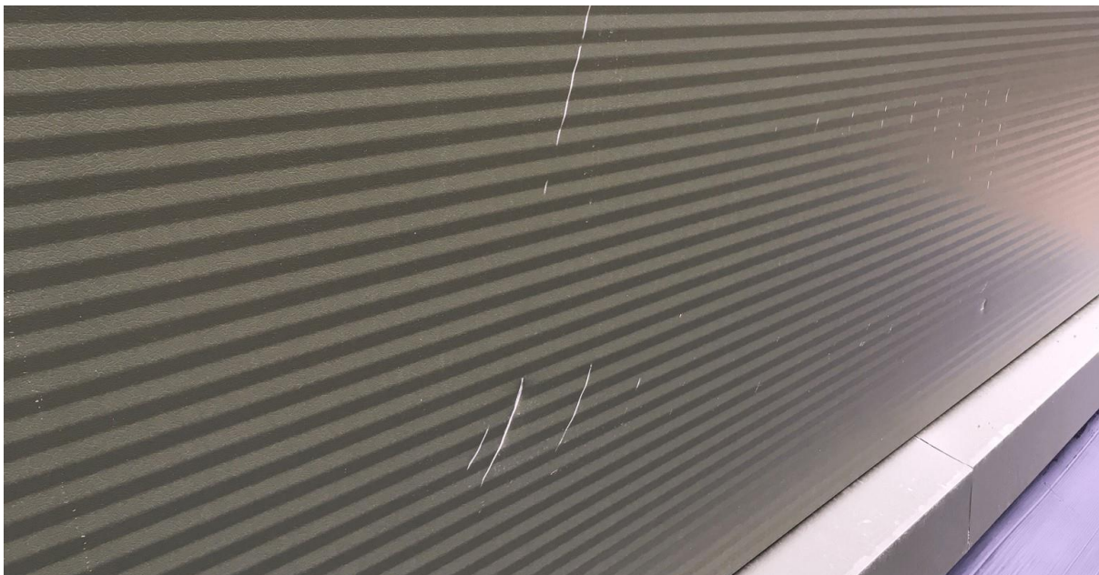
Fig 9 A series of scratches and small dents on a lightly profiled panel which detracts from the aesthetics and could impact on the remediation process and subsequent guarantee