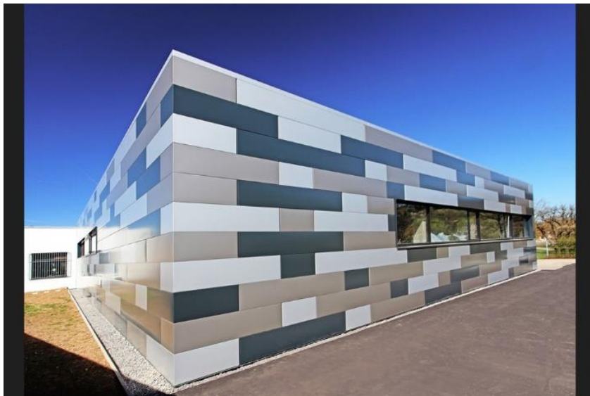
Fig 2 Demonstration of how the aesthetics can alter with incident light and orientation

Structure tolerances can affect flatness of installed profiled roofing and cladding products and systems and the installed flatness of façade and rainscreen systems. If façade flatness is a key objective an adjustable sub frame should be specified (typically rainscreen carrier systems incorporating 'helping hand brackets') at the design and installation phases. The design specification should also specify flatness/ aesthetic limits required within the contract documentation. Overall horizontal and vertical façade flatness is generally expressed in +/- mm/10m.