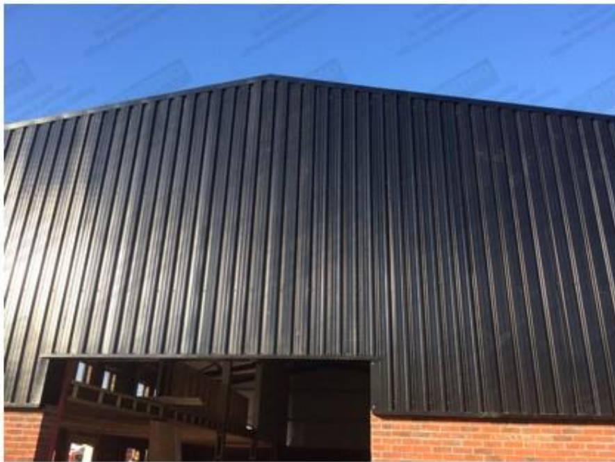
Fig 1 Reflected sun light producing highlights and shadows across a façade

If the inspection does not highlight surface imperfections during the process and under normal lighting conditions (not under the glancing light that might be encountered at sunrise or sunset, for example) the roof or wall cladding and building façade panel are considered to be within normal manufacturing and installation specifications. However, if imperfections can be seen under these conditions and the project team deems them unacceptable, there may be grounds to request rectification or replacement of the item in question.