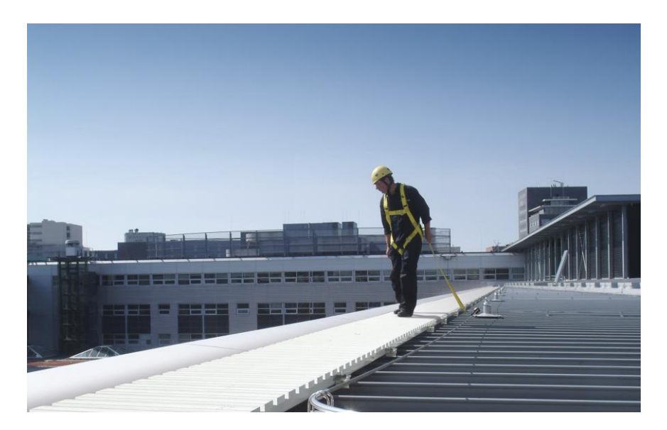
Cable system and walkway

The ACR publication covers, testing, standards, design, and most requirements for HLL cable restraint systems.