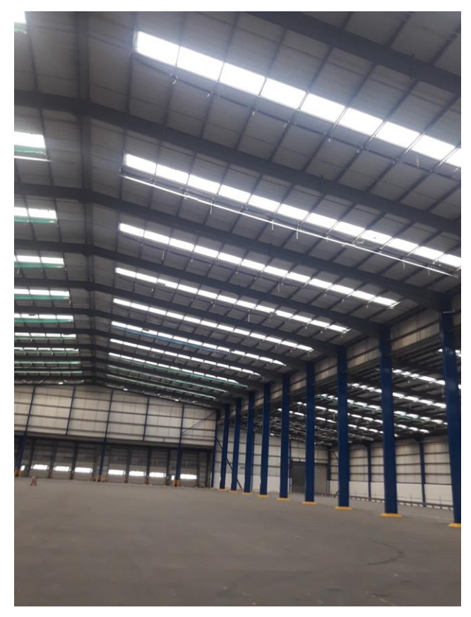
Rooflight replacement internal

This goes way beyond the minimum requirements for non-fragility. Due to the nature of the material this also means less resin is required within the manufacturing process compared to traditional reinforcement techniques, resulting in a significant reduction in embodied carbon in the finished product with no loss in performance.