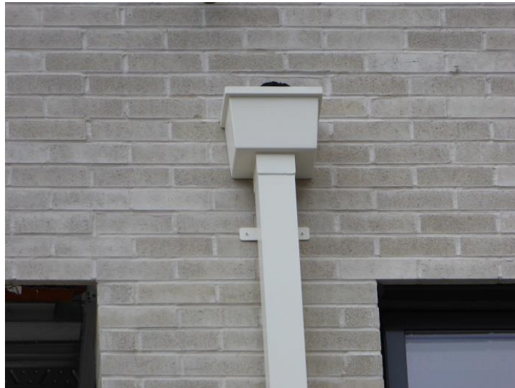
Guttercrest RAL 9010 hopper and downpipe

The RW44 square downpipes measured 100mm x 100mm and were supplied in three metre lengths. The neat collars and rear fixing pipe clips provide a clean linear finish in keeping with the rest of the project. Alongside the downpipes, RW207 rectangular rainwater hoppers in 270mm x 180mm size were delivered directly to site.