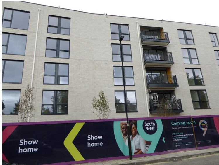
Guttercrest rainwater hoppers and downpipe at SW9

Guttercrest rainwater goods are available to order directly from the firm or through a large network of builders' merchants.