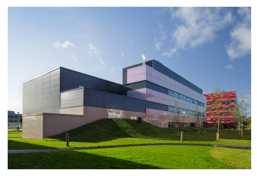
Energy Technologies Building, Nottingham University

Opportunities for creative detailing abound for example, specifying bullnose edges, rounded corners and rising feature elevations in shining silver or corporate colours or under brise soleil overhangs and perforated profiles to allow subtle light through.