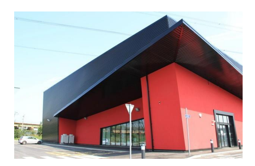
Crossrail Training Academy, Ilford east London

The aesthetic benefits of modern metal cladding systems offer the designer and client with the opportunity to explore a mixed colour palette and inventive forms, which in some cases can result in complexity at junctions and interfaces. However, these attributes cannot be considered in isolation from the building function; namely to provide shelter, insulation, durability, structural stability and structural strength. During the design stage the designer has to assimilate all of these parameters to provide a fully functional and useable building; without these considerations the benefits of aesthetic and design opportunities offered by metal are unlikely to arise.