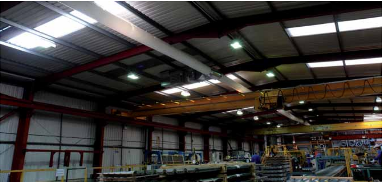
A 410 square metre SolarWall™ metal solar cladding system was installed on to the south eastern elevation of the profiles mill building at CA Group's headquarters. (Top)